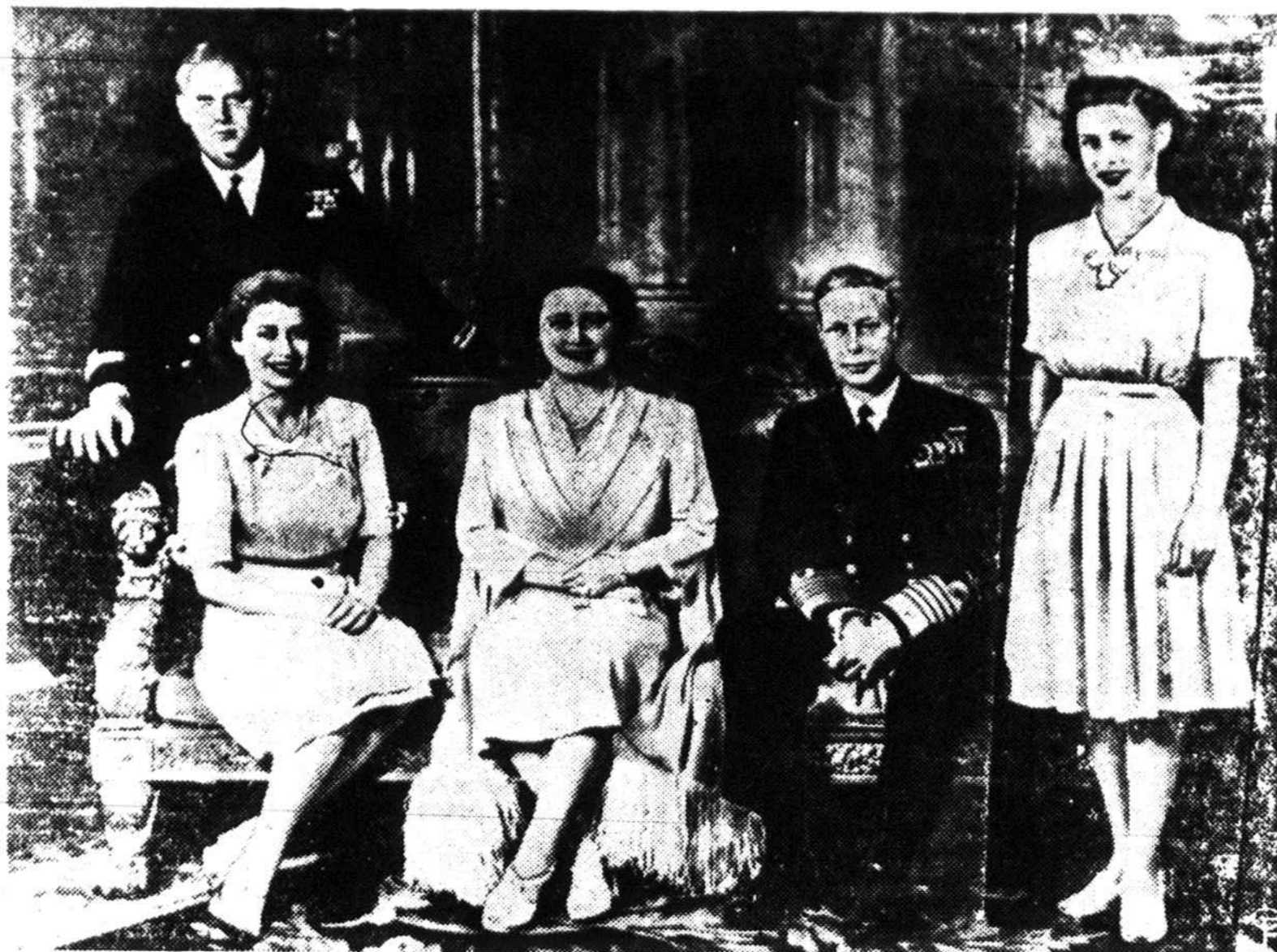
THE MOST RECENT PHOTOGRAPH of Britain's Royal Family, the above portrait was taken in Windsor Castle, just a short time before the royal wedding. Left to right are the groom-to-be, Lt. Philip Mountbatten; bride-to-be, Princess Elizabeth; Queen Elizabeth; King George and Princess Margaret Rose.