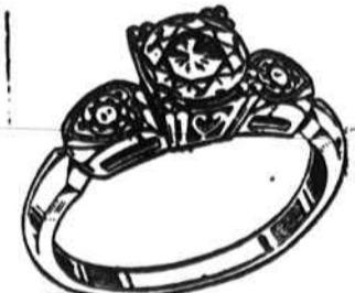
She Will Love A