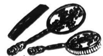
Give her one of Our Beautiful Dresser sets