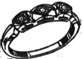
WEDDING SETS $37.50 up