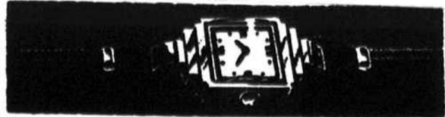
EXQUISITELY DESIGNED WATCHES $27.50 to $62.50

Jewelry With Character at LILIUS JEWELERS IN RITZ BUILDING