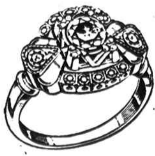
A DINNER RING Will Always Be Appreciated