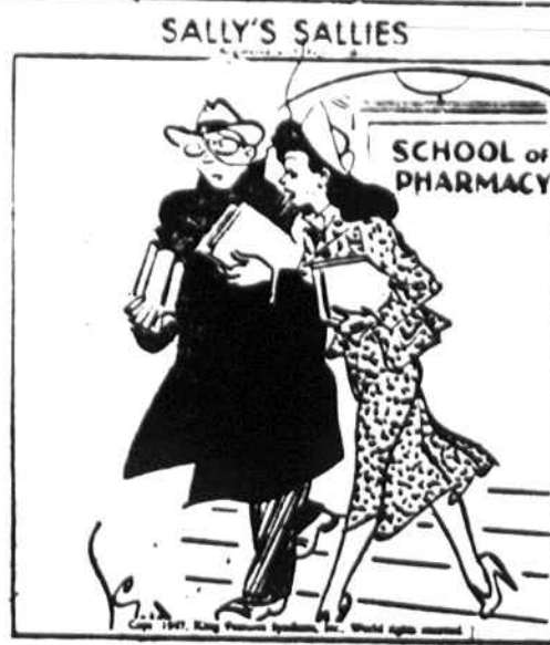
"I learned how to make a drug store fruit sundae today."