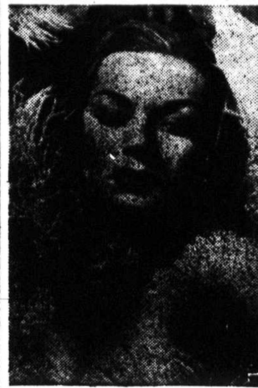
THIS PHOTO of film actress Hazel Brooks won first prize at the International Society of Photographic Arts exhibition in Los Angeles. The judges said it was the expression in Hazel's eyes that won her the award. The picture and 119 other prize-winning photographs will be shown abroad.