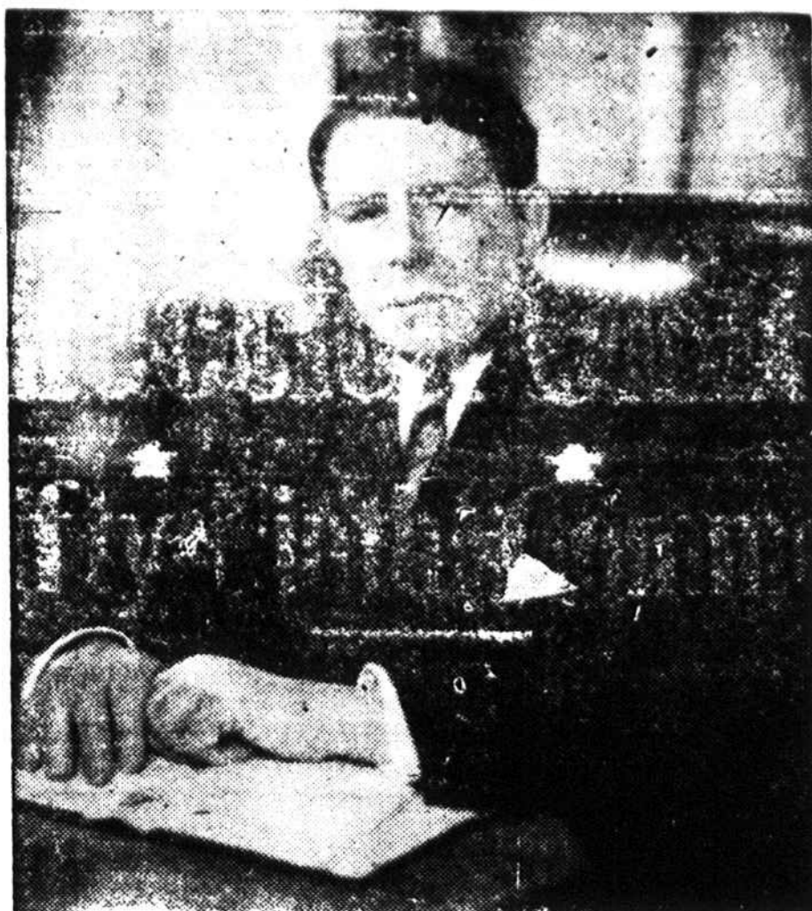
Former Governor J. M. Broughton was winner of the short and long term for U. S. Senator in Saturday's primary over the incumbent William B. Umstead.