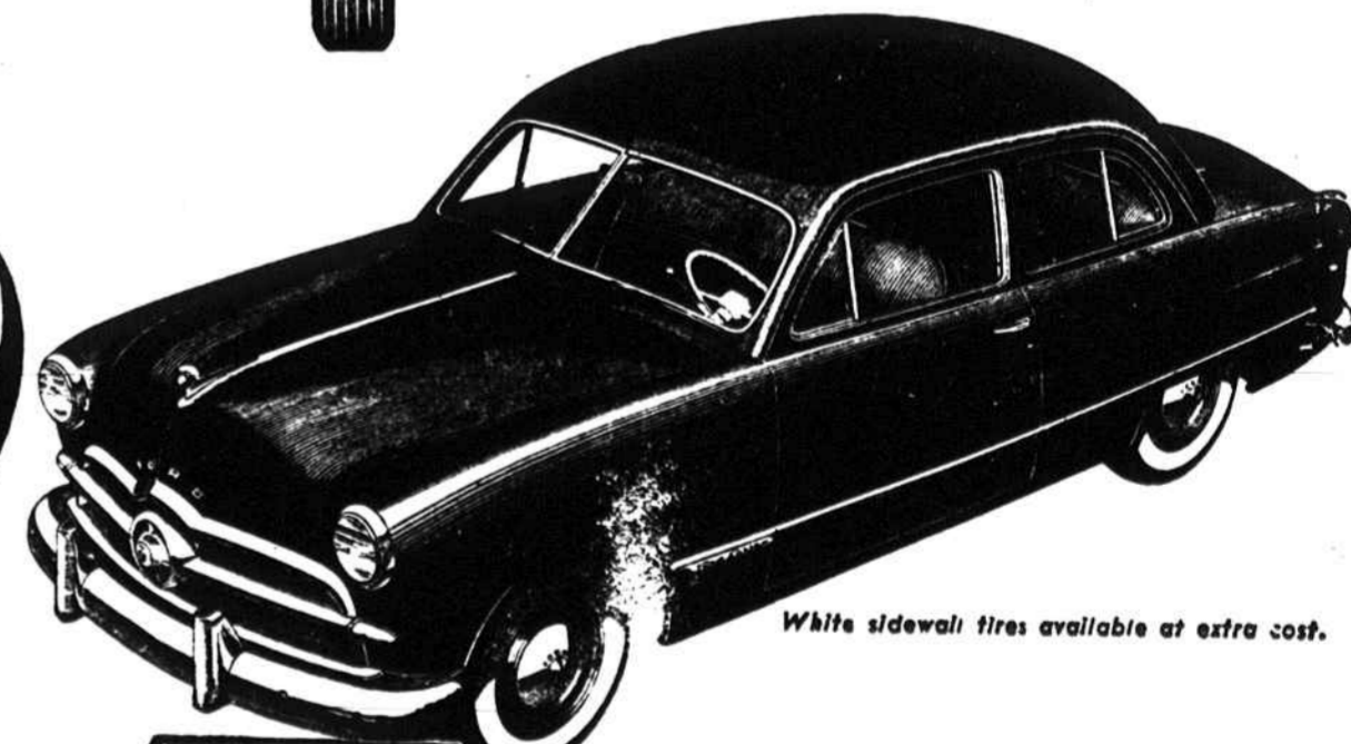
White sidewall tires available at extra cost.