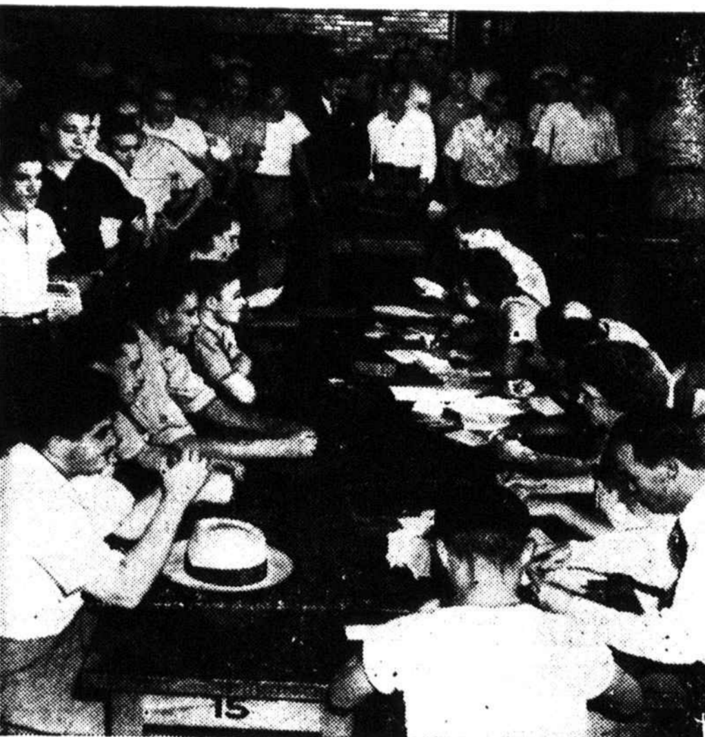
TYPICAL OF THE THOUSANDS of young Americans registering for the second peacetime draft is this group of 25-year-old New Yorkers waiting their turn to fill out questionnaires. Some 20,000 registration offices across the nation were faced with the task of checking the eligibility of 9,600,000 young men. First on the list are those born in the year 1922 after August 30. Other eligibles will register later.