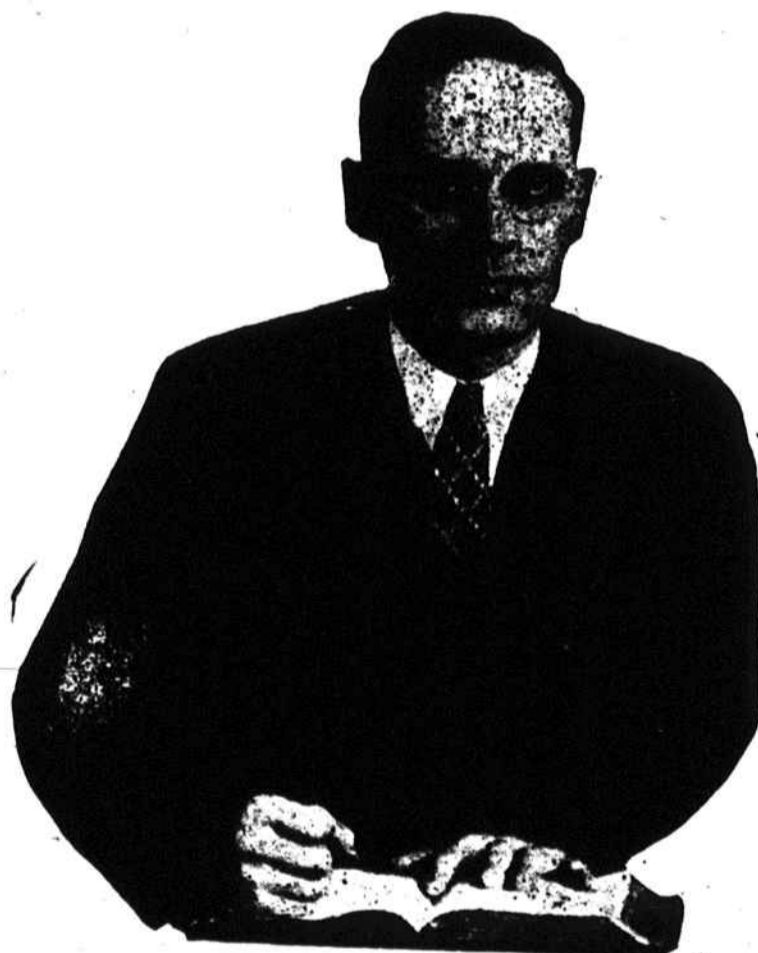
The Man With The Message