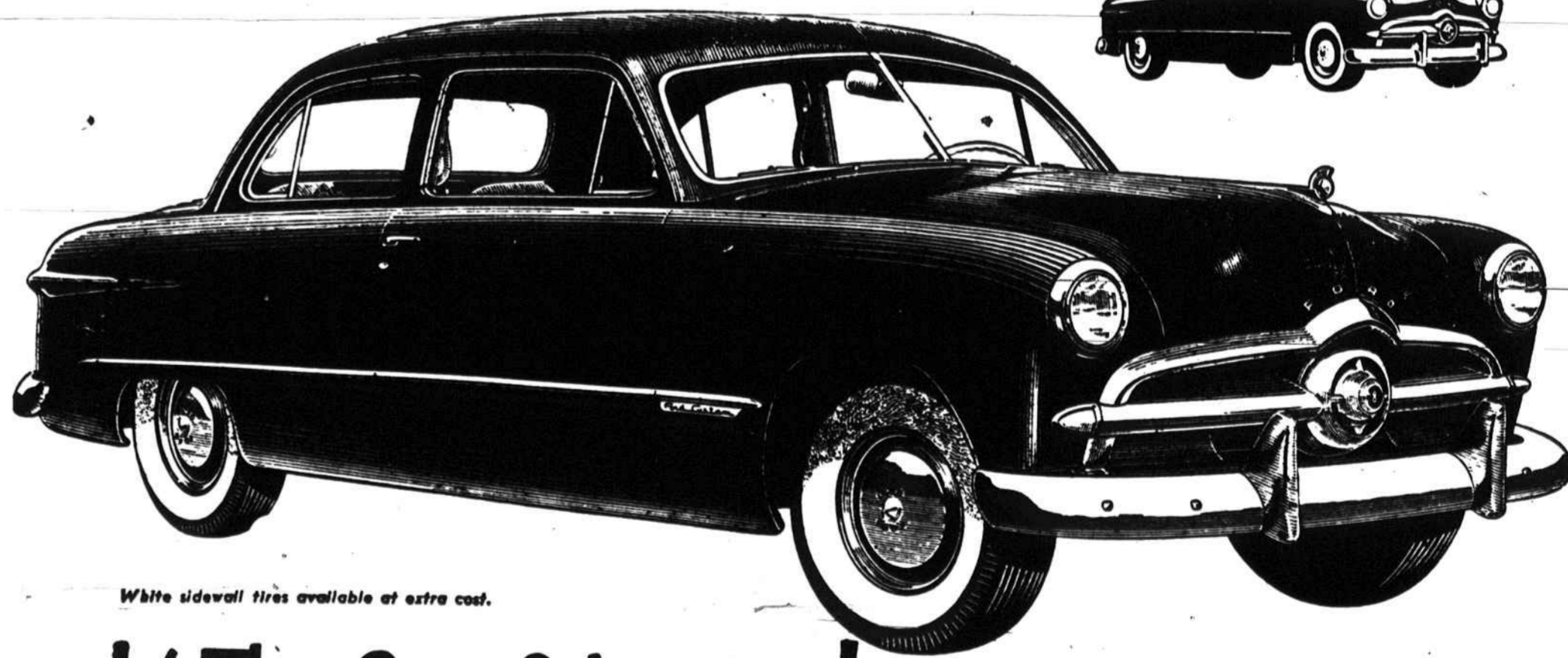
White sidewall tires available at extra cost.