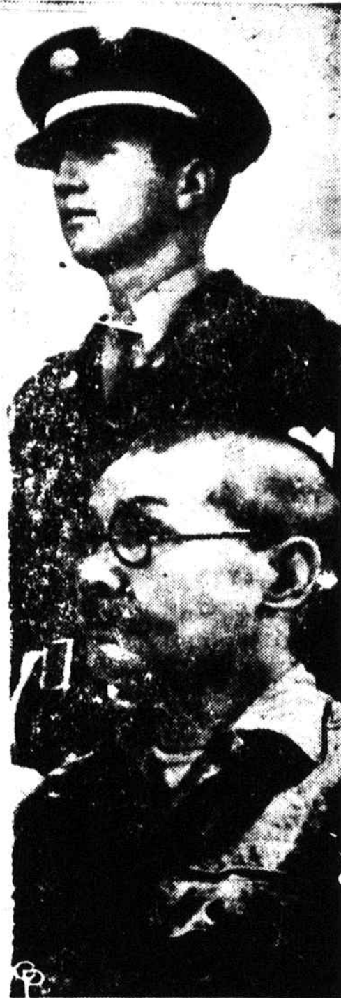
ADMIRAL Soemu Toyoda, in command of the Japanese navy at the time of the surrender, is impressive as he listens to testimony at the trial in Tokyo of army and navy leaders before a special U. S. military tribunal. Standing behind Toyoda is an American Army military policeman.

The rabbit-hunting season in N. H. C. roll, opens Nov. 25.