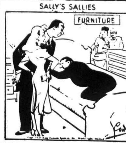
"This department has ruined a good clerk."