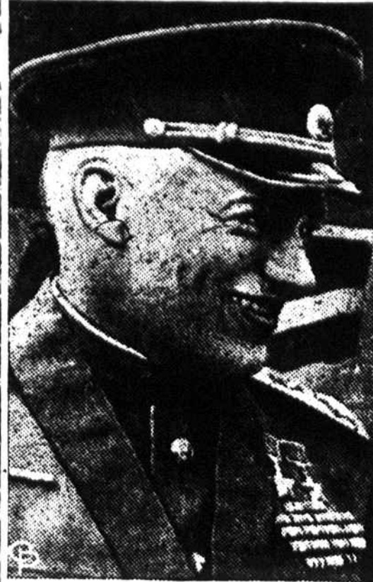
SPECULATION has become rife on future Red moves in Germany following confirmation by American intelligence sources that Marshal Konstantin Rokossovsky (above), chief of the Soviet western armies, has established headquarters in the Russian zone. Berlin dispatches gave the location as Fuerstenberg in Mecklenburg.