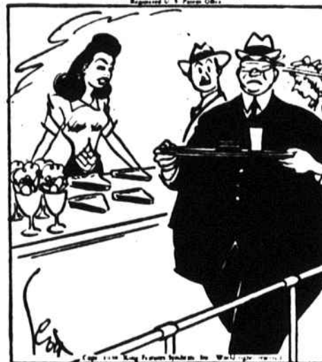
"He always blindfolds himself after he gets a sandwich and milk."

—Read Herald Classified Ads For Profits—