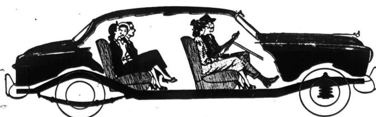
Cutaway view shows the "Mid Ship" Ride and brand-new springs that let the wheels step over bumps!

Ford Dealer invites you to listen to the Fred Allen Show, Sunday Evenings—NBC Network. Listen to the Ford Theater, Friday Evenings—CBS Network. See your newspaper for time and station.