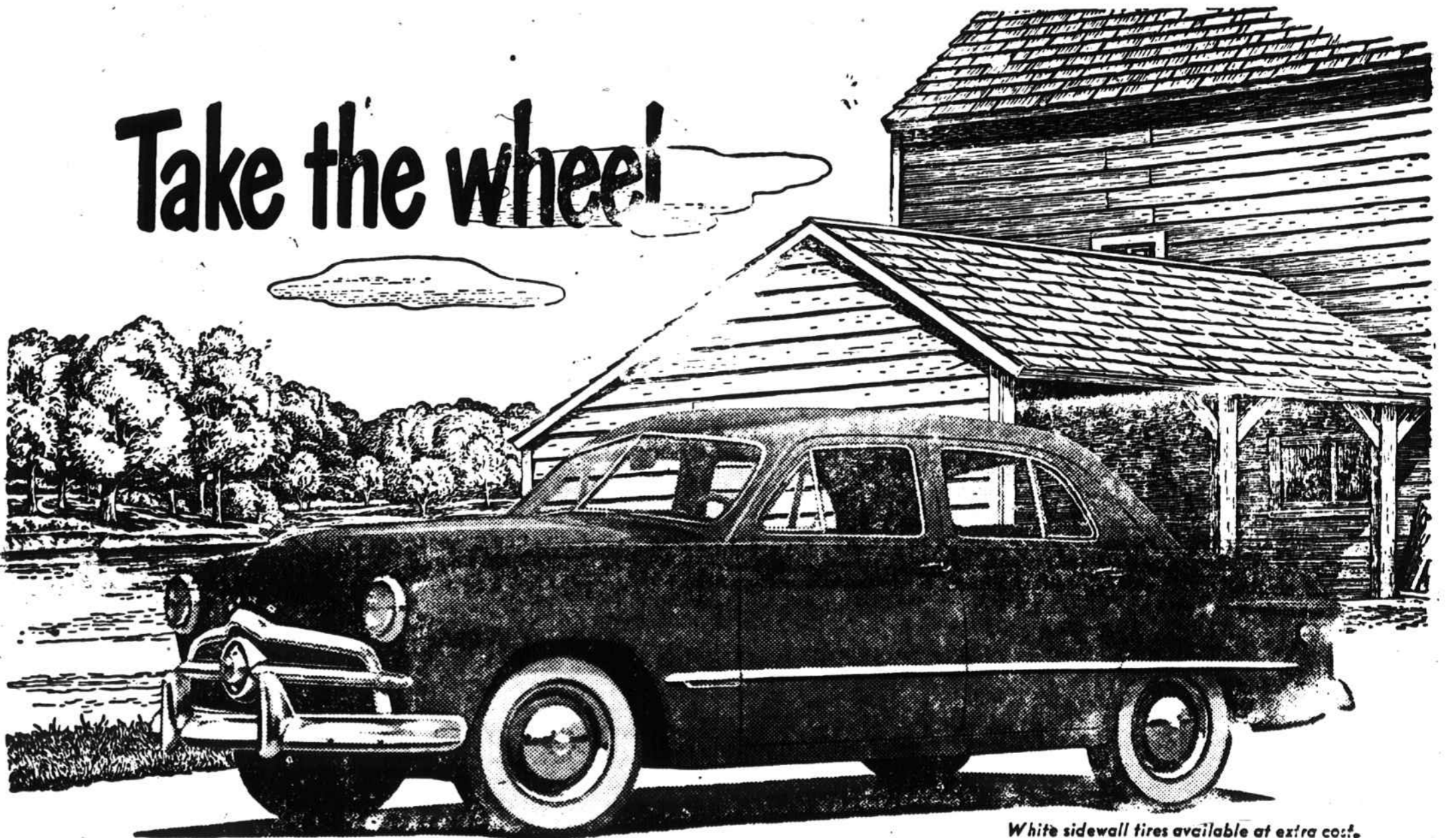
White sidewall tires available at extra cost.