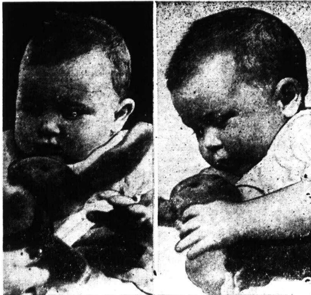
A TOY RABBIT handed to Prince Charles (left) poses a problem for the tiny heir to the British throne in this picture taken by royal command at Buckingham Palace, London. But soon the royal son of Princess Elizabeth and the Duke of Edinburgh decides to kiss his little toy (right) in the manner of all babies, royal or otherwise.