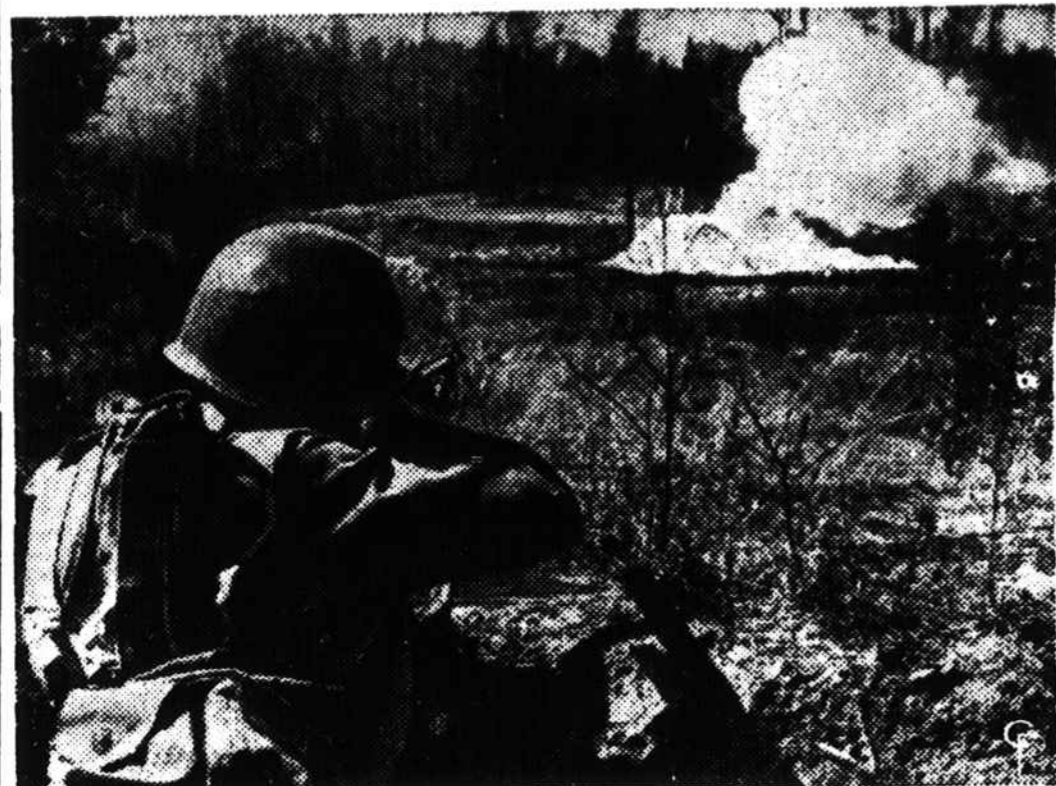
READY TO PULL THE TRIGGER, a Marine infantryman holds his rifle to his shoulder as he waits for the "enemy" to emerge from a bunker fired by a flame thrower during a demonstration at Quantico, Va. The display of fighting tactics was put on for visiting congressmen.