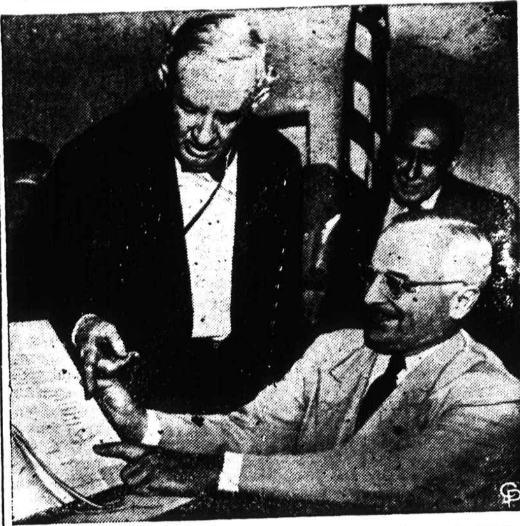
AFTER FORMALLY signing the North Atlantic Defense Treaty, in Washington, President Truman, points to his signature on the historic document. He is showing it to Sen. Tom Connally (D-Tex.), Chairman of the Senate Foreign Relations Committee, leader for ratification. At right is Sen. Theodore Green of Rhode Island.