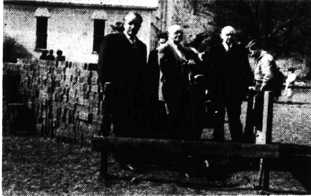
Scene At Ground Breaking At Scotts Creek