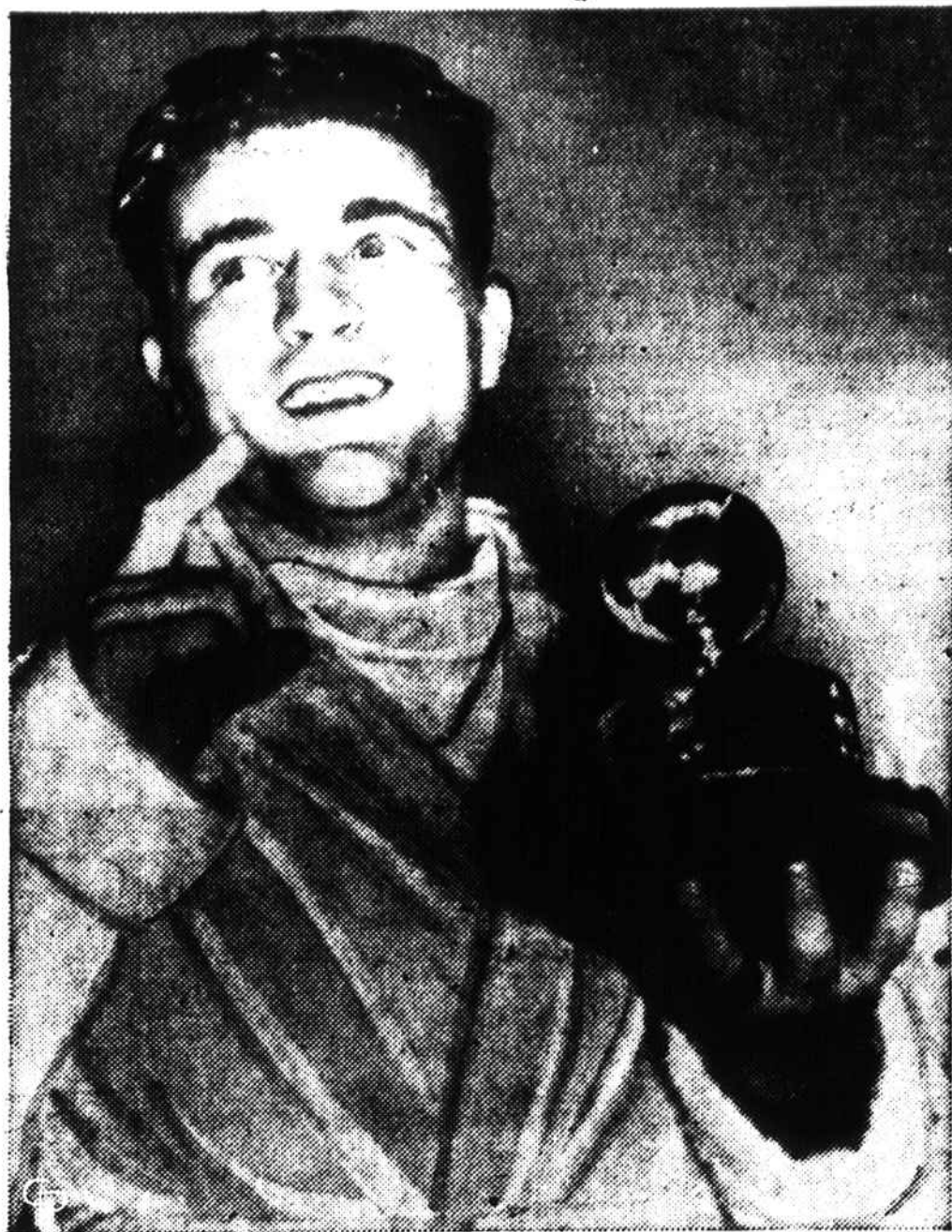
BY RADIO from London comes this picture of Joey Maxim of Cleveland, posing with his trophy after he had kayoed Freddie Mills in the 10th round to win the world's light heavyweight championship. Maxim is a former Golden Gloves king.