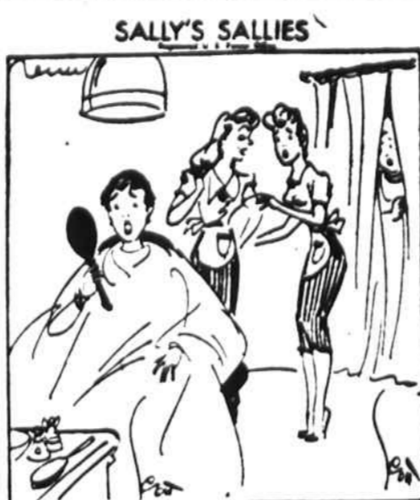
"She came here to spy on our methods. So what!"