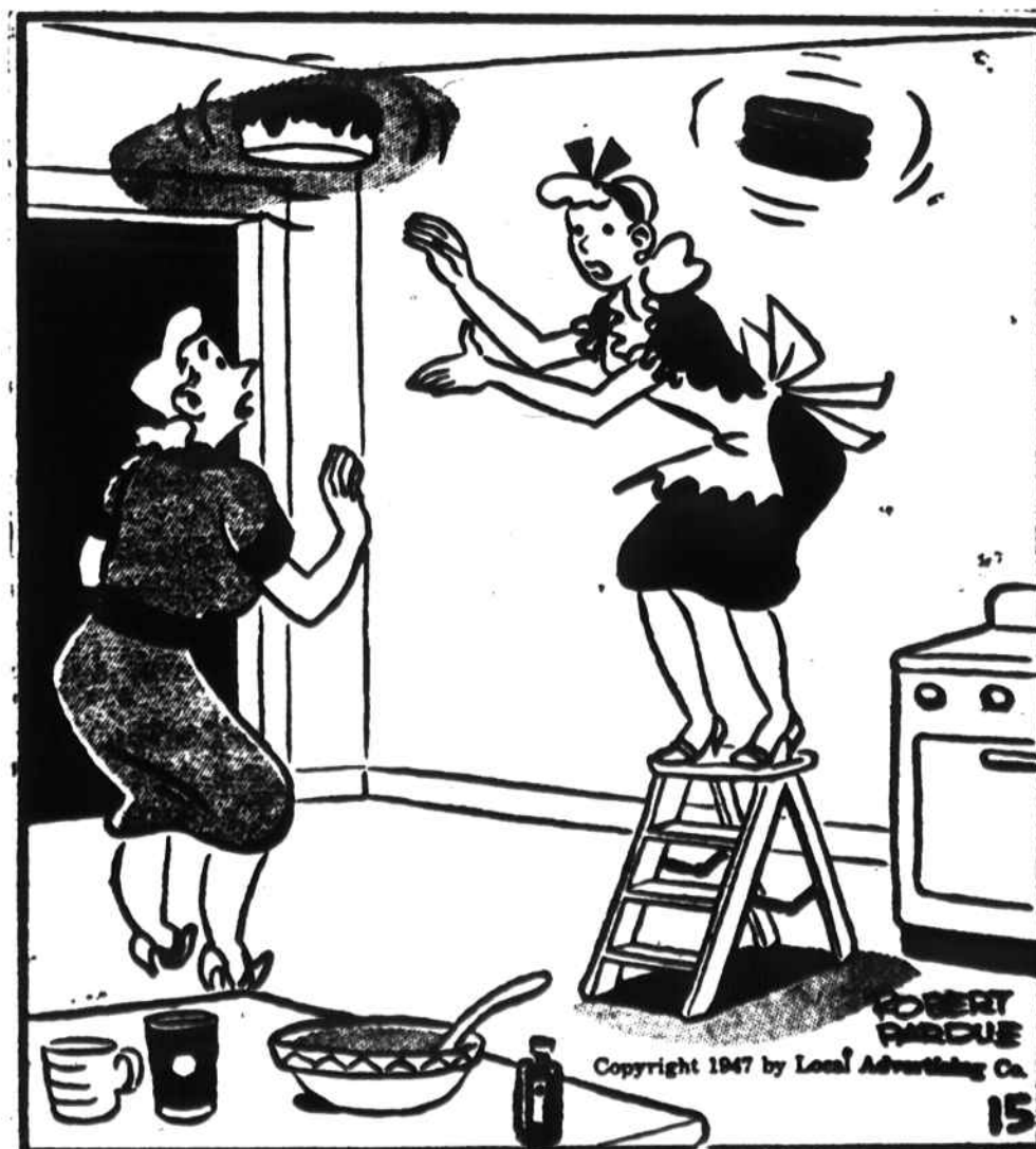
"The cakes that I bake in my new range from JACKSON FURNITURE CO., are light as a feather."

FURNISHING LAFFS by Jackson Furniture Co.