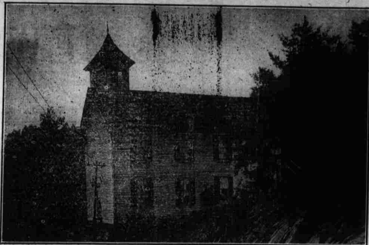
Free Will Baptist Church and Masonic Hall.

Naturally rich as the soil in that which makes men, the county has sent out those who have made their mark on the world and Madison's sons and