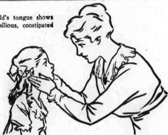
Child's tongue shows if bilious, constipated

Dodson's Liver Tone is entirely vegetable, therefore harmless and can not salivate. Give it to your children.