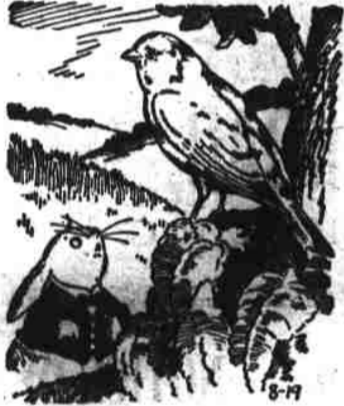
"Hello, Linnet!" Cried Peter.

IT DIDN'T take Peter Rabbit long to find the sweet singer whose happy trills had caught his attention.