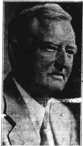
JOHN N. GARNER