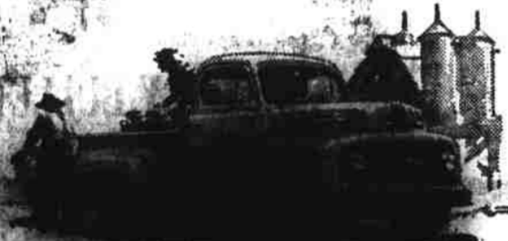
New steering seats in the Series F-1 trucks like this new 614-11. Fishing, thanks to new steering column gear-shift! All new Ford Trucks for '51 will save you money, because all feature the POWER PILOT!

Choose from over 180 models. Choose from four great engines, V-8 or Six. Come in today and get the facts.