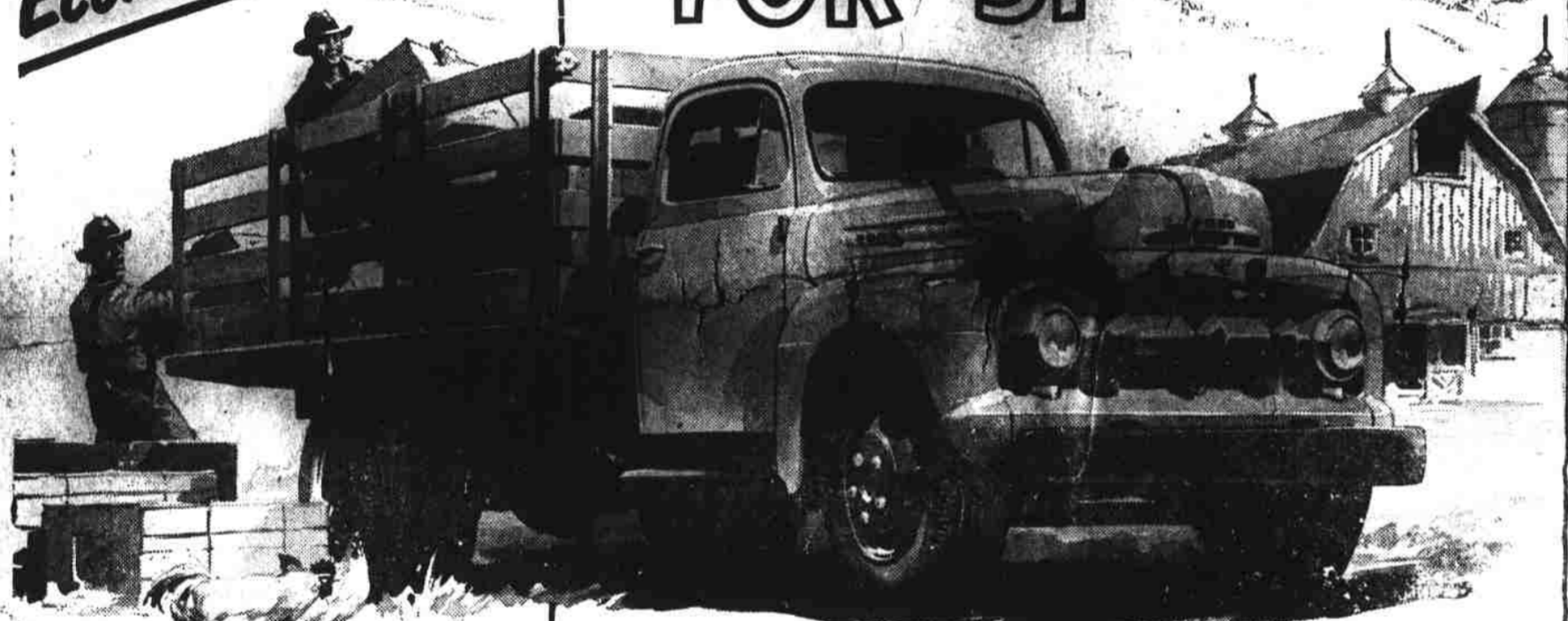
New driver efficiency! This new F-5, one of over 180 Ford Truck models for '51, features Ford's new 5-STAR EXTRA Cab. Foam rubber seat padding, many other features at slight extra cost. Modern new front end makes Ford the sty's favorite.

Want to get there fastest, with the mostest, for the LEASTEST?