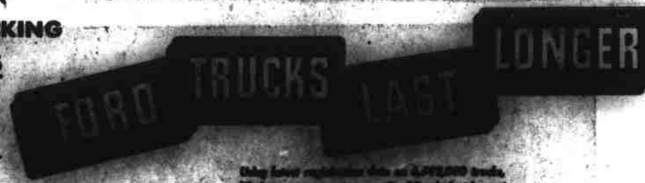
Only low engine costs on 1,000,000 trucks. No engine costs on Ford Trucks for 1951.