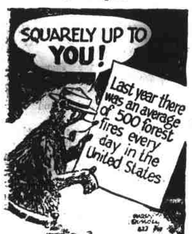
Drary American has a definite