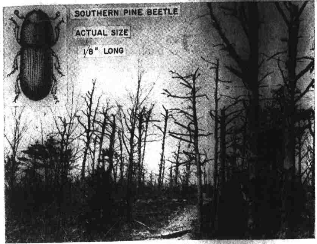
SOUTHERN PINE BEETLE KILLED THESE TREES

The beetle, Dendroctonus Frontalis, punctures the bark, lays eggs in the living tissue beneath. The eggs hatch into larvae, which eat the cambium, thus killing the tree. Consult your Forester when bugs attack