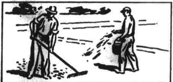
C. In the spring, rake, fertilize and seed as usual.