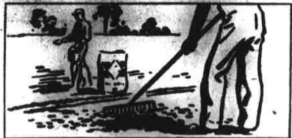
B. Apply Cyanamid at recommended rates.