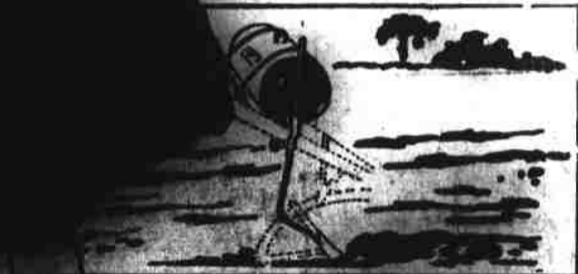
A. Work up seed bed and apply soil fumigant.