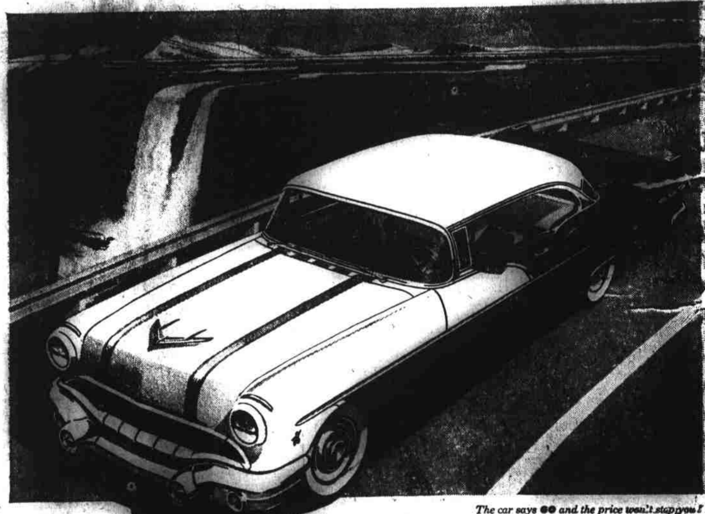
THE 600 TWO-DOOR CATALINA The car says 60 and the price won't stop you!