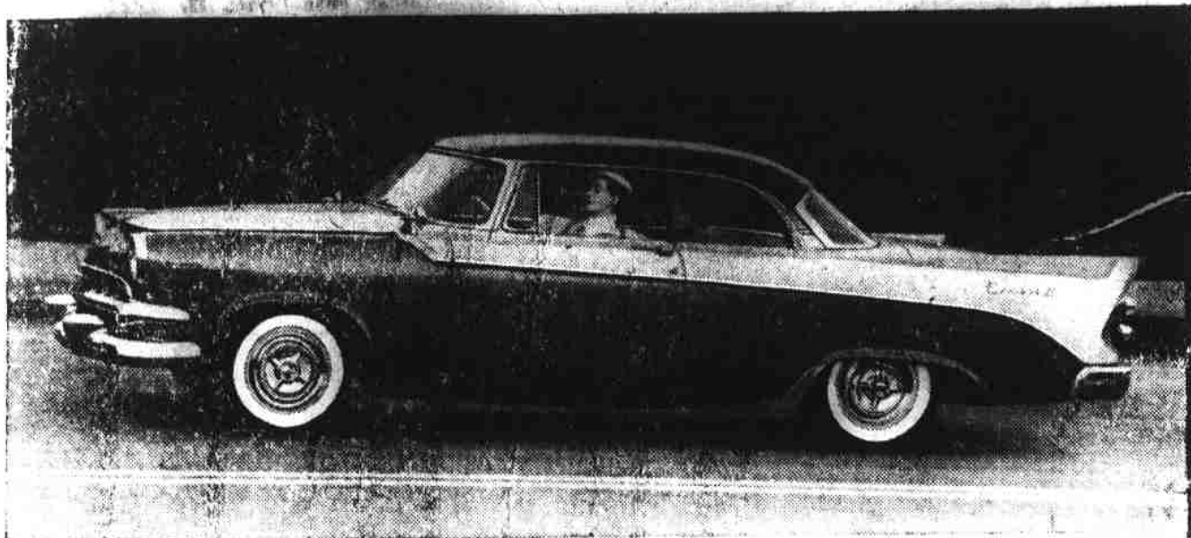
FIGURE IT THIS WAY! For as little as 95 cents a week more than you'd pay for a small hardtop in the "lowest price field"—you can step up to the biggest, best looking, most luxurious hardtop in the "medium price field"... the Dodge Coronet V-8 Lancer!