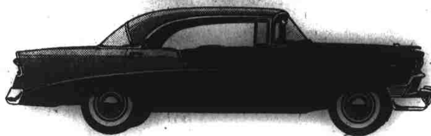
Bel Air Sport Sedan