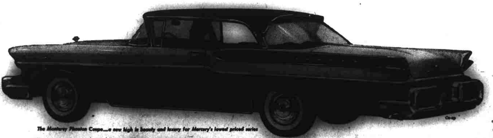
The Montclair Phaeton Coupe...a new high in beauty and luxury for Mercury's lowest priced series

Everything that counts in a car has been changed dramatically! Mercury for '57 presents: Dream-Car Design · Biggest size increase in the industry · Exclusive Floating Ride · New Keyboard Automatic Transmission Control · New 255 and 290 hp V-8 engines · Exclusive Power-Booster Fan · Dream-Car features everywhere you look. Stop in...see how The Big M outdates them all.