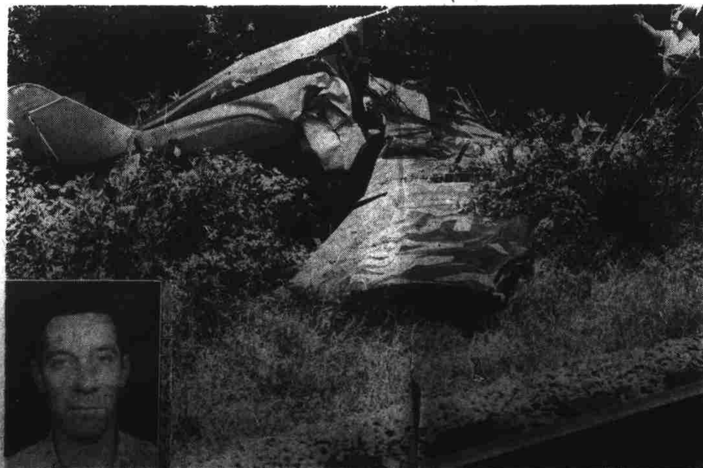
Picture of Airplane Crash Opposite Pikes Straight