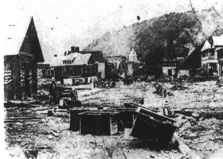
Scene In Marshall During 1916 Flood