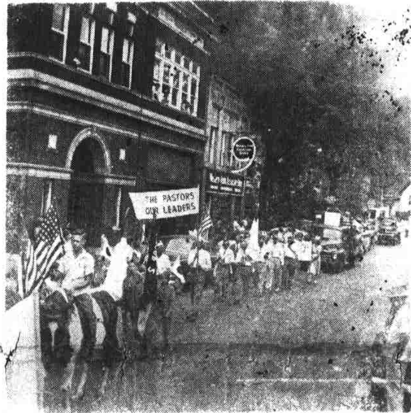
V. B. S. Parade Several Years Ago