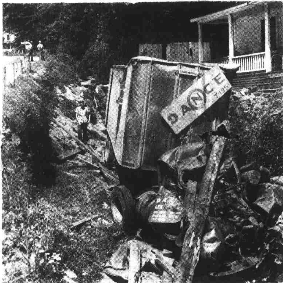
Truck Hits Frisby Branch When Brakes Fail