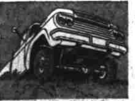
NEW 4-WHEEL DRIVE! Built by Ford—of low Ford prices! There's power at all wheels to tame the toughest off-road going, takes grades of over 60%. And, new 4-wheel-drive models give you modern Short Stroke power, Six or V-8. Available in half-ton and 3/4-ton models—early 1959.

Ford's rugged Short Stroke Six now gives you even better gas economy. And behind every '59 Ford stands the industry's outstanding record for durability. An independent study of 10 million trucks proves, for the 13th straight year, that Ford trucks last longer. See your Ford Dealer today... and go Ford-ward for modern style and savings!