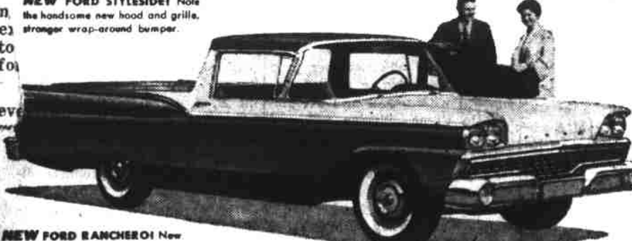
NEW FORD RANCHERO! New from longer wheelbase to greater loadspace!