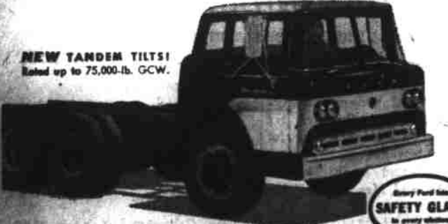
NEW TANDEM TILT! Rated up to 75,000-lb. GCW.