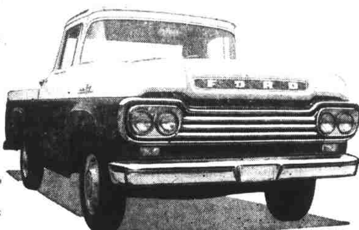
NEW FORD STYLESIDER! Note the handsome new hood and grille, stronger wrap-around bumper.