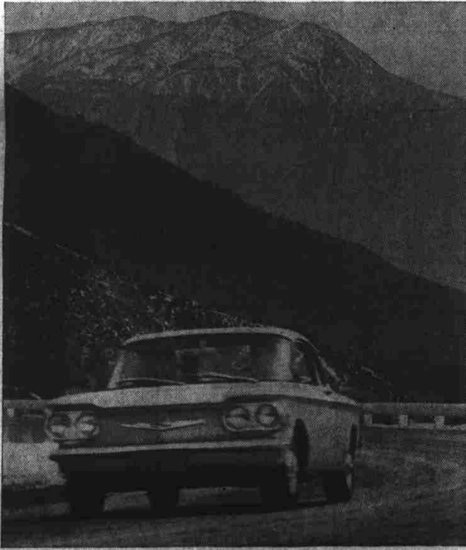
See the Chevy Mystery Show in color Sundays, NBC-TV—the Pat Boone Chevy Showroom weekly, ABC-TV.

As we go about our daily chores today we are constantly bombarded with pamphlets, leaflets, tracts, and talks from representatives of various sects. Each group appears supremely confident that they have the only true word about God and his kingdom. They are truly zealous in their missionary activities and are really de-