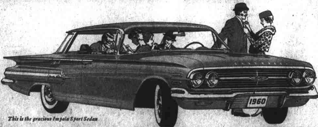
This is the gracious Impala Sport Sedan

More people are buying Chevrolets (including Corvairs) than ever before—and Chevrolet's popularity leadership is reaching new, all-time highs! That means the buying's better than ever for you right now. So drop in for a chat with your dealer while the choice is wide and the time is right!