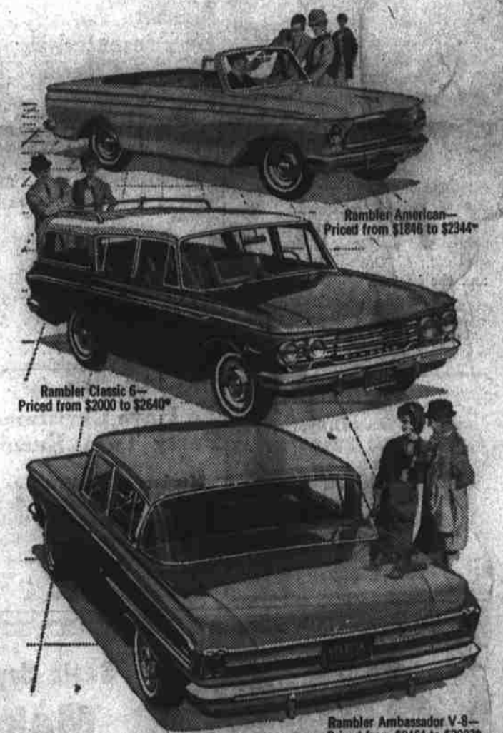
Rambler American— Priced from $1846 to $2344*