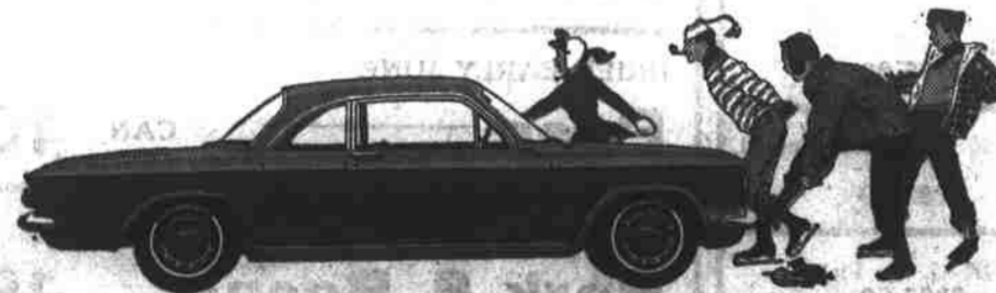
CORVAIR MONZA CLUB COUPE