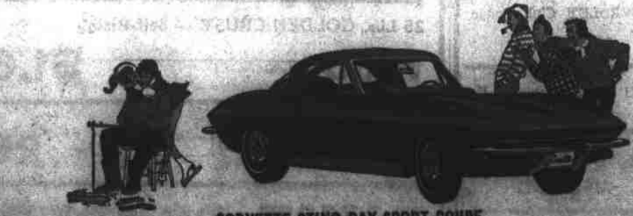
CORVETTE STING RAY SPORT COUPE

Now—Bonanza Buys on four entirely different kinds of cars at your Chevrolet dealer's