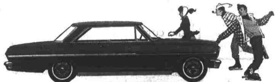
CHEVY II NOVA 400 SPORT COUPE