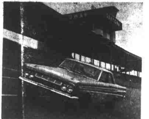
On Sept. 21, we set out to test the stamina and rugged construction of a specially equipped and prepared team of 1964 Comets at Daytona, Fla.

Some Durability Run: toughest challenge of automotive stamina ever faced!