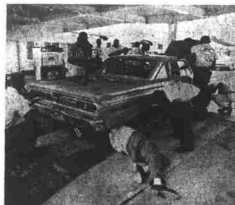
These Comets drove day and night for 100,000 miles. Average speed of the lead car—over 105 mph—includes time for refueling and maintenance.