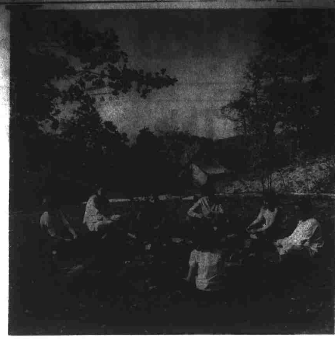
Girl Scout Campfire Scene

Madison County girls are shown around the campfire during a Troop Camping trip to Camp Pisgah last Fall. The background is Hightop Unit, one of the four tent units at the camp which is located in Transylvania County near Rosman.