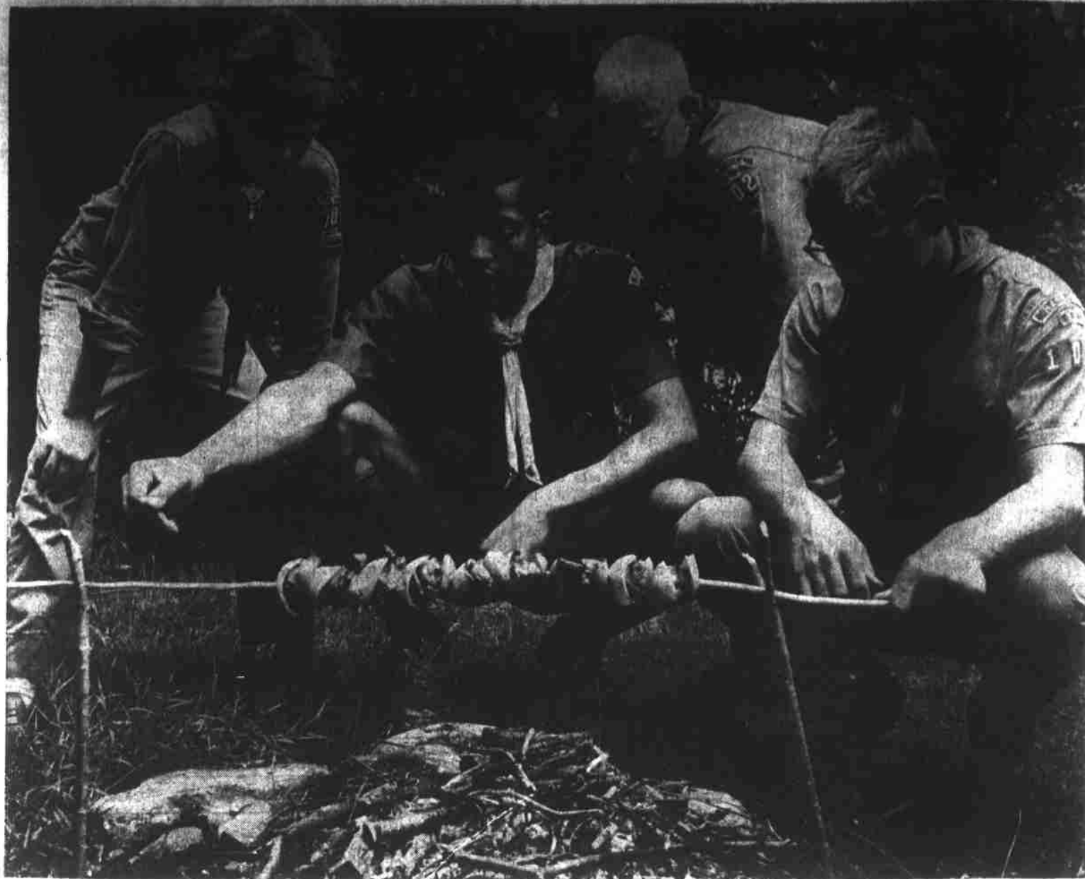
Camp Daniel Boone of the area Boy Scouts of America recently received a perfect score of 100 in an inspection conducted by Court Baker, regional deputy, southeastern states, BSA. Purpose of the inspection was to make an objective review of the camp operation, covering adequacy of present facilities and need for expansion, as well as a complete appraisal of staff and program.