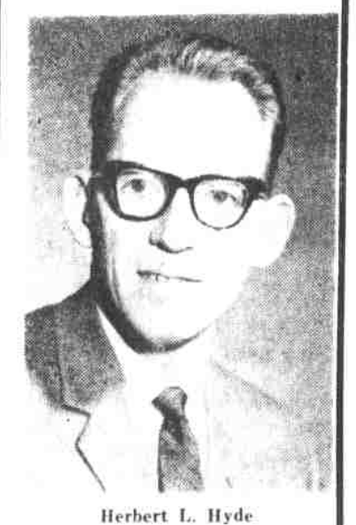
ferbert 1. fryde