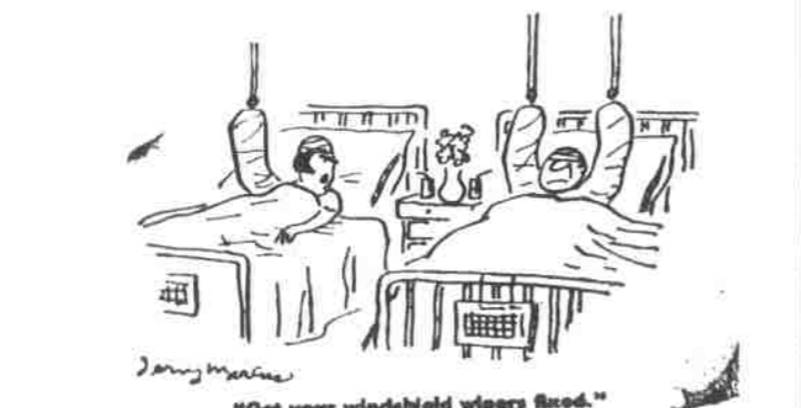
"Get your windshield wipers fixed."

Effective equipment contributes to many accidents.