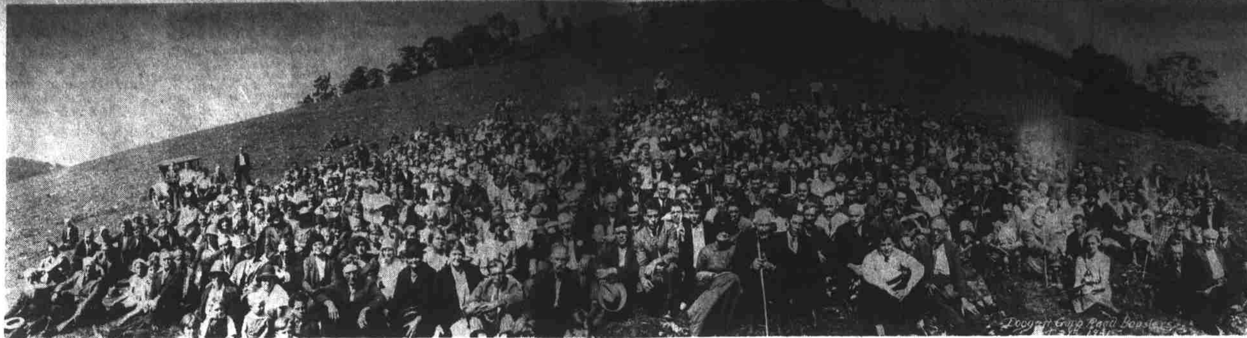
Pictured above are the Doggett Gap Road Boosters who worked so hard to get the Doggett Gap road built. The picture was taken on Oct. 3, 1931 at Doggett Gap.