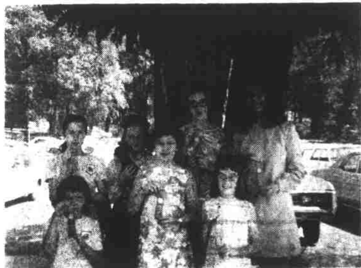
Shown above are pictures of Madison County 4-H winners at the 4-H Demonstration program in Marshall last Saturday.