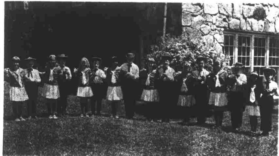
BALD MOUNTAIN CLOGGERS ENTERTAIN AT WOLF LAUREL