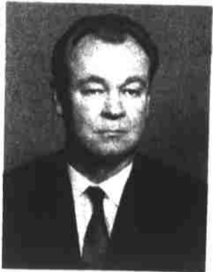
REP. LISTON B. RAMSEY