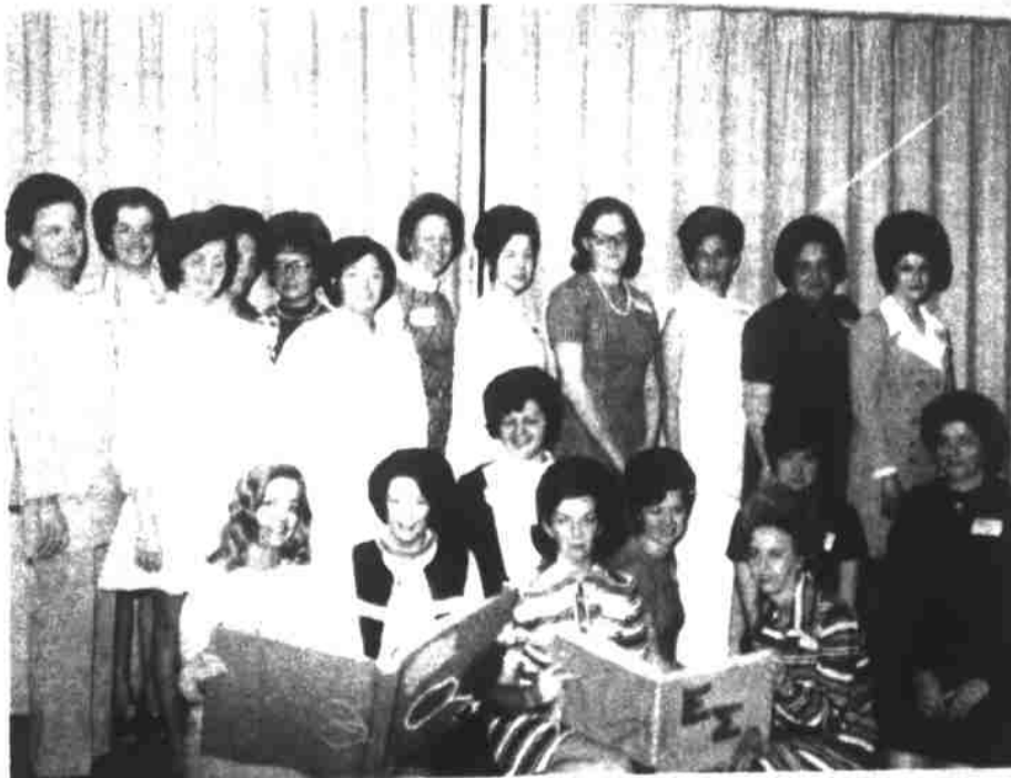
SHOWN ABOVE are the ladies who attended the meeting here Monday night when plans were made to establish an Epsilon Sigma Alpha International Sorority Chapter here. (Story on Page 8)