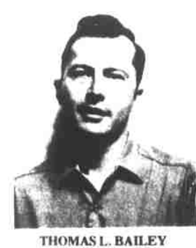
New Forester In Hot Springs