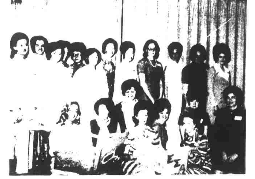
SHOWN ABOVE are the ladies who attended the meeting here Monday night when plans were made to establish an Epsilon Sigma Alpha International Sorority Chapter here.