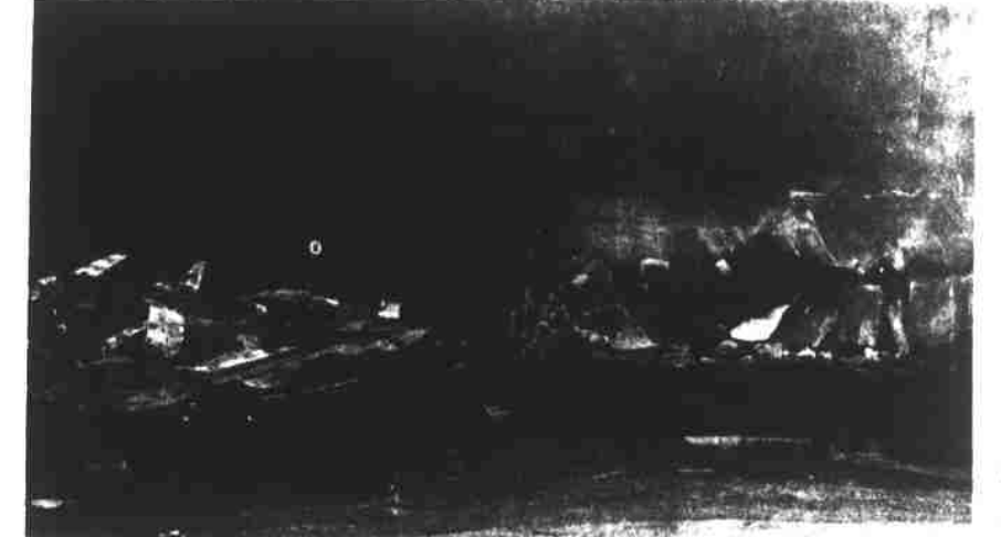
THE SMOLTERING REMAINS of the two-story wooden garage and storage building at Barnard, owned by Dedrick Brown, which were destroyed by fire early last Friday morning. Damage was estimated at $8,000.