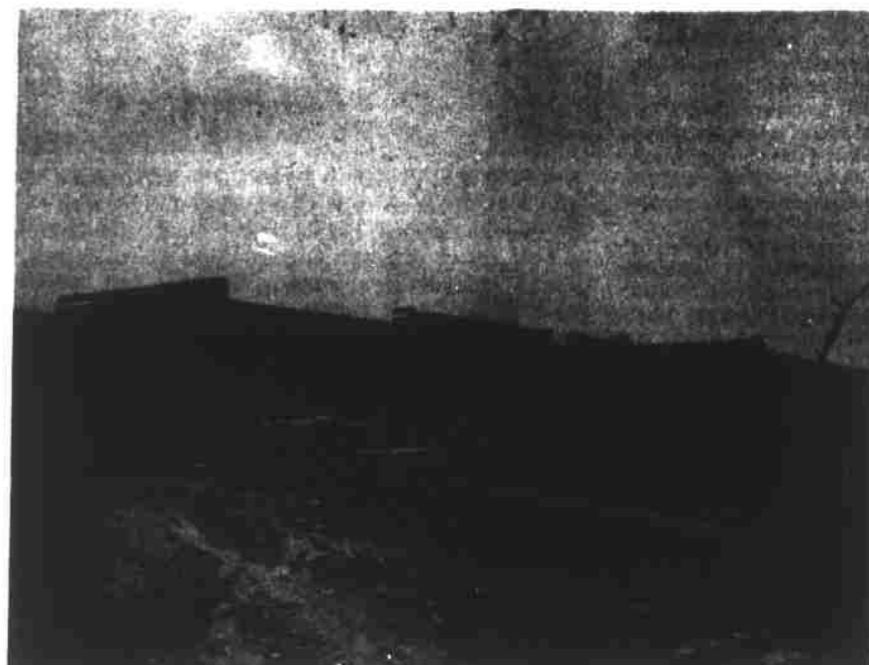
CONSOLIDATED HIGH SCHOOL starts to "grow" on the Marshall by-pass as picture above reveals. Shown is one of the units of the school taking shape. Tons of bricks, steel and other materials are on the site as construction continues, although delayed at times by inclement weather.