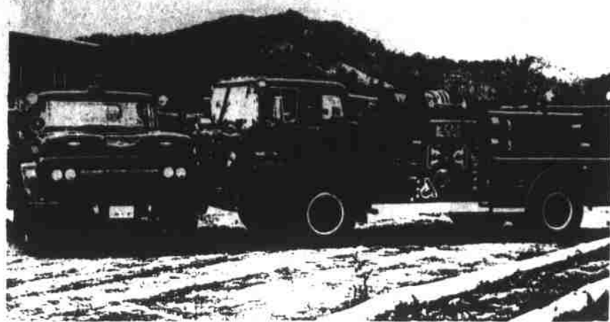
MARS HILL'S "NEW" FIRE TRUCK is pictured at right. This truck is used solely within the corporate limits except in rare cases. The truck on left is the 1961 pumper which is still in use.