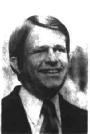
ATTORNEY GENERAL Robert Morgan has announced as a candidate for the United States Senate seat now held by retiring Senator Sam J. Erwin, Jr.